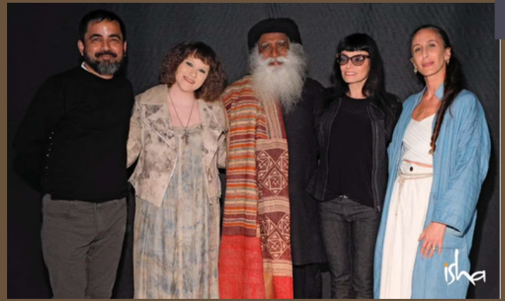
FASHION FOR PEACE NEW YORK FASHION SHOWCASE

SABYASACHI MUKHERJEE PARTNERS WITH THE ISHA FOUNDATION