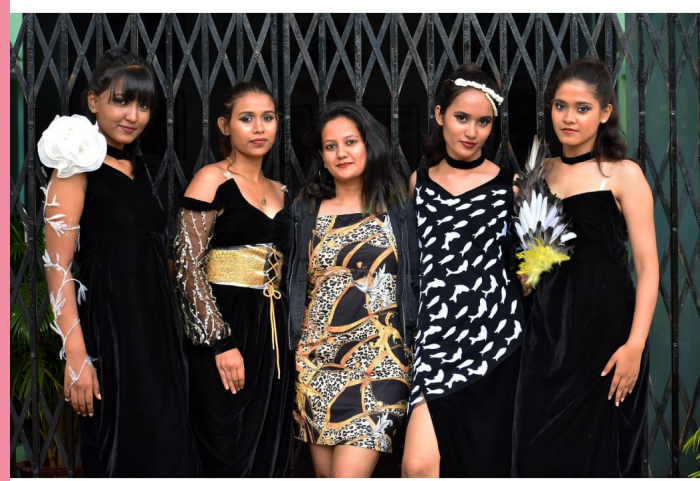
Designer-TD Rachana Theme wisdoms and wild