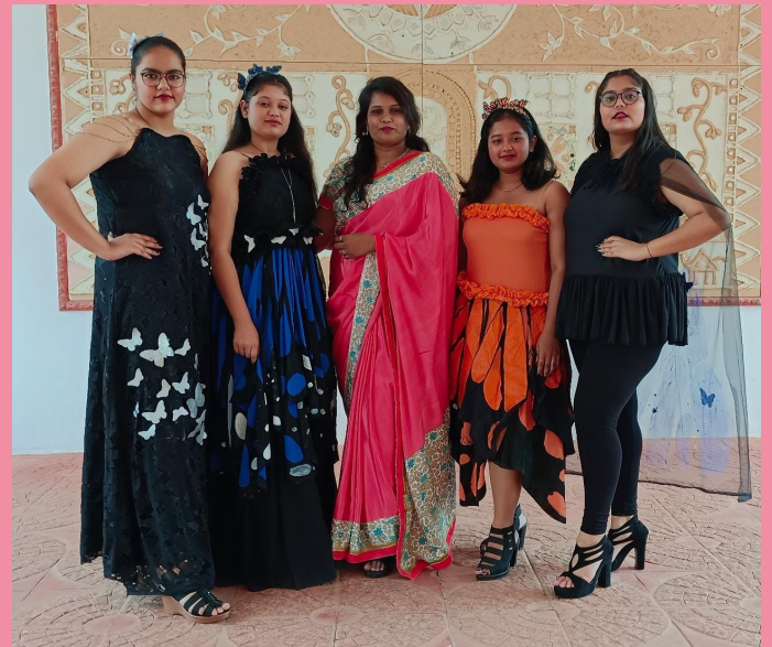
Designer : Ac Anitha Theme : monarch butterfly