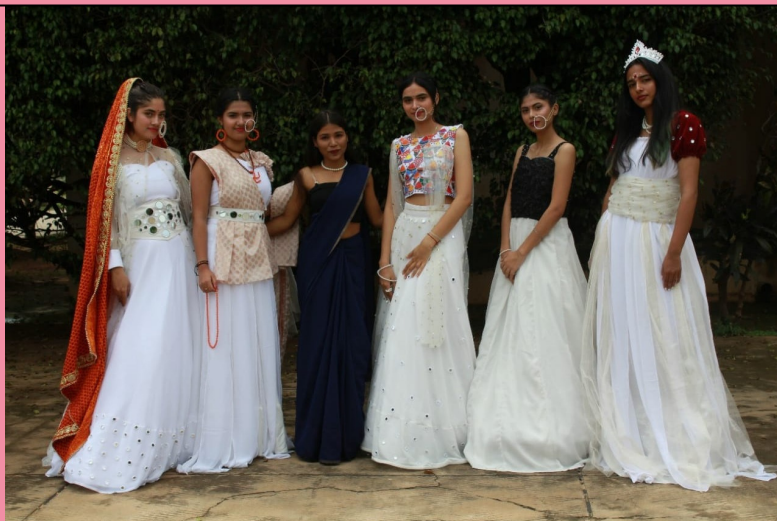
Designer- Poonam Inspiration- Ganga