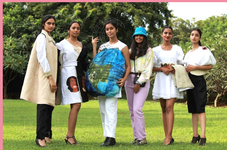
Designer - SD Bhavya Theme-Stop Racism & Follow Sustainability